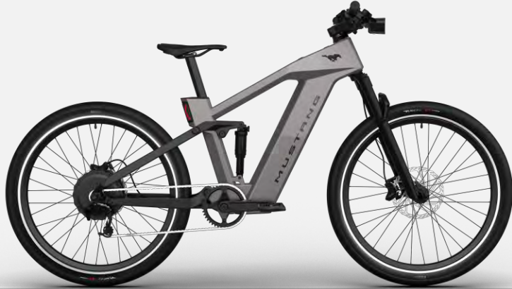
MRSP - $4,000