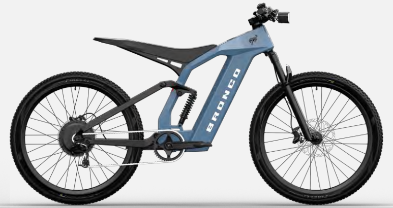
MRSP - $4,500