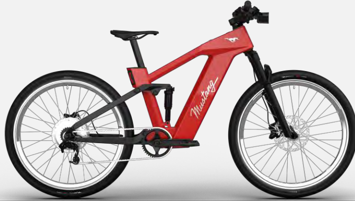
MRSP - $4,000